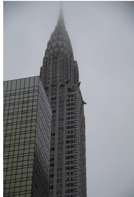
Fig. 2 The Chrysler Building needle in mist photo R.S. Architect William Van Allen 1930.

Town space contracts when globalized metropolitan time dilates and when flows management favors satellization and orbitation of outskirts by city centers. Their prosperity and posterity are thus celebrated and protected much more than the suburbs citizens' ways of life. We can notice that technological innovations do not involve automatically cultural and social changes.