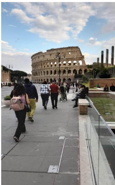
Fig. 1 Under Colisseo di Roma, a new subway station, photo M.A.C.

Therefore, it relegates to the bottom of the agenda the links with the outlying districts and their citizens. The Coliseum, amphitheater built on the ruins of Neron's Palace by Vespasien, with the spoils of Jerusalem sack, in 70 after J.C, and inaugurated by Tibere, in 80, was an evergetism gift. Show and fights memories, glorious triumphs offer not only a legacy of past but also, with its subway station, a new draft of present and metropolitan future [1].