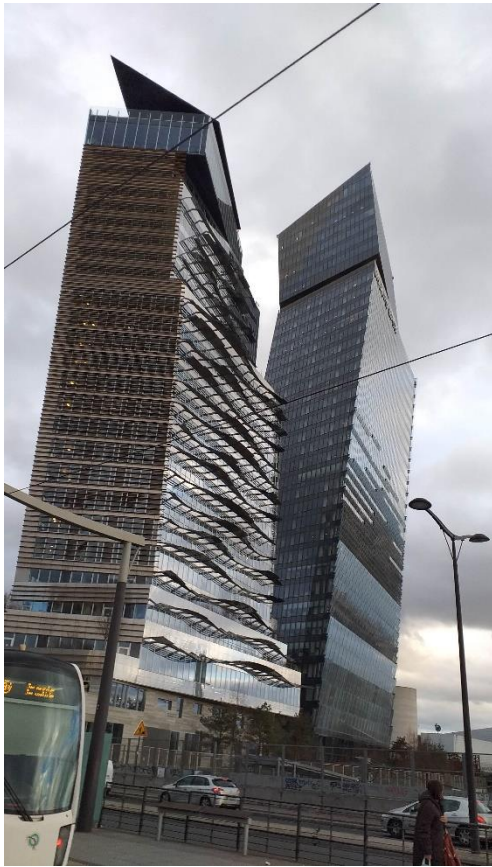
Fig. 4 Tours Duo , J. Nouvel architect. Multifunctions Towers and Multimodal Flows? Photo Christian Sallenave

The satellisations of peripheries by centers prioritize flows of cars, tramway, bus, subway, bicycle, hoverboard, wheelchair create street settings as public spaces. They dilute also city time with predominant flows' management. Consequences with this globalized metropolitan management: a new model of urban planning and standardized housing conception. With metropolisation flows acceleration and social networks addictions, new housing decoys appeared in our street decors and behind our screens.