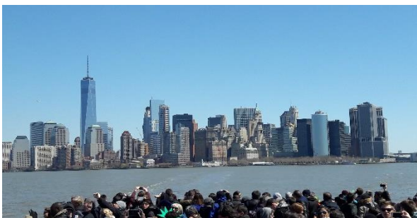
Fig. 3 Tourists migration and Manhattan's skyline

We can see also recurrent delays of ecological cities' policy, not as flexible as needed which penalize reallocation of unoccupied offices and housing and speculative inflation regulation. In order to understand why housing problematics are always treated in emergency, we have to take notice of satellization phenomena which exist in cities in their process of globalized metropolisation. We would be able to understand why selfies display heritages' emblems (Fig. 2) more often than possible warmth and hospitality symbols, and metropolitan skyline more often than cities' lifes (Fig. 3).