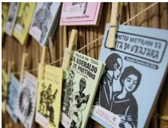
Figure 3. Chapbooks for sale in a traditional Centro de Tradições Nordestinas ( https://www.significados.com.br/literatura-de-cordel/ ). Access on November 9th, 2025.

In present times, as Amanda Muniz da Silva lectures, Cordel literature has achieved the technical possibilities of creation and diffusion disposed by Internet. Actually, adaptation to different media has always a major feature of Cordel literature and nowadays one can find sites, blogs, homepages devoted to chapbooks, which, therefore, acquires a digital format (Silva, 2023, pp. 42-43). Nonetheless, the main characteristics of traditional cordel have remained, like the duty to inform, teach, and amuse the public, displaying woodcut paintings, verses couched in popular language, being easy to understand and portraying facts and figures of everyday life, ranging from politics, religious topics, to folkloric tenors.