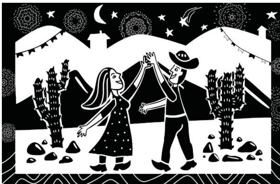
Figure 2. Woodcut reproduction on the chapbooks' cover ( https://brasilecola.uol.com.br/literatura/literatura-cordel.htm ). Access: November 8th, 2025.