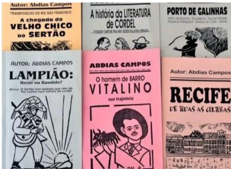
Figure 1. Some Cordel chapbooks in typical shape ( https://www.cnnbrasil.com.br/entretenimento/dia-do-cordelista-conheca-literatura-de-cordel-patrimonio-cultural-do-brasil/#google_vignette ). Access: November 8th, 2025.