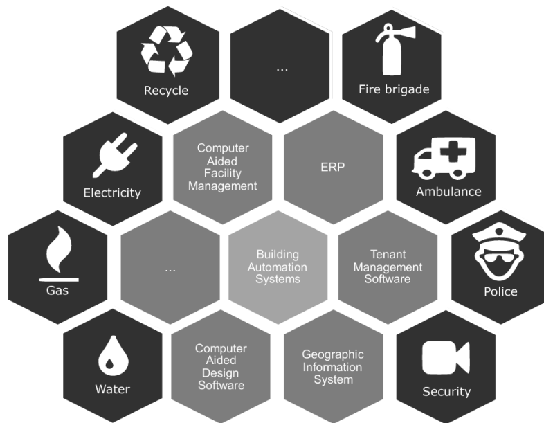
Fig. 1 Smart building data integration layers [4].

evaluating the performance of SBs to assist all professionals involved in the project design phase. Ozadowicz (2024) [10] further supports this assertion by highlighting the challenges in understanding SB systems, hindering the realization of their full potential.