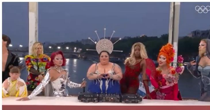
Paris Olympics MOCKS Jesus and the Last Supper with Drag Queens

Figure 1. Screenshot from the news reporting on the 2024 Parisian Olympics Opening Ceremony that included this mage of drag queens as Jesus and the apostles.