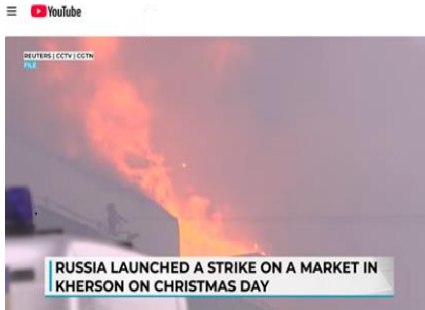
Figure 3. One of the attacks of the Russian Armed Forces on the people of Ukraine that took place on Christmas, 2023.

There is nothing surprising in these Figures. The Parisians already mocked the hundreds of thousands of French soldiers perished in Napoleon’s Eastern European wars by building a dome for the general; the Americans already dirtied the memory of their Declaration of Independence by attacking one sovereign country after another in the 21st century; the Russians already ignored their Lomonosov’s, Pushkin’s, Mendeleev’s and Tolstoy’s faith by eliminating religious education in Soviet times.