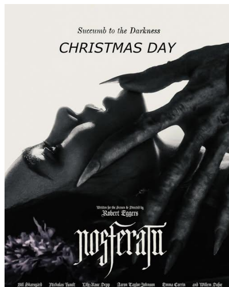
Figure 2. Poster for Robert Eggers' 2024 vampire movie "Nosferatu"—released for American theatres on Christmas Day, celebration of Jesus' birth, as advertised with this image.

Figure 1. Screenshot from the news reporting on the 2024 Parisian Olympics Opening Ceremony that included this mage of drag queens as Jesus and the apostles.