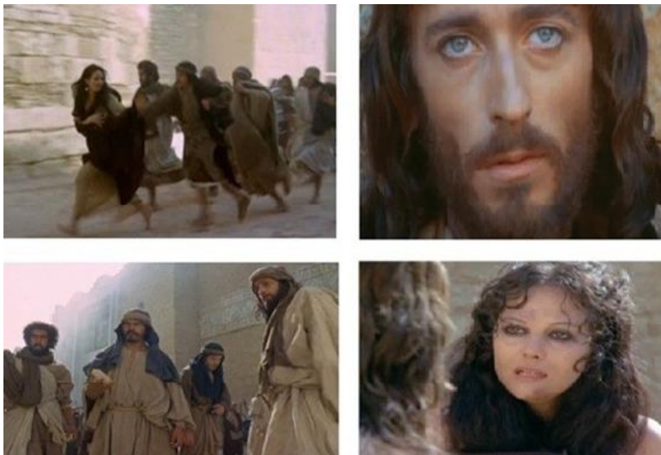
Figure 5. Four screenshots from Zeffirelli's Jesus film. Top left: The adulteress (Claudia Cardinale) chased by a crowd to stone her to death. Top right: Jesus (Robert Powell) tells the crowd: “Let him who is without sin among you be the first to throw a stone at her” (John 8:1-11). Bottom left: None of the men threw his stone: The woman was saved. Bottom right: Jesus lets the deeply touched woman leave with these words: “Go, and sin no more”.

“The greatest among you shall be your servant” (Matthew 23:11); “...all sins will be forgiven the children of man...”; (Mark 3:28); “Judge not, and you will not be judged” (Luke 6:37); “For the law was given through Moses; grace and truth came through Jesus Christ” (John 1:17)—these were also his particularly memorable sentences, and others' characterization of him, for the millennia to come. Indeed, the spirit of each was captured by this sequence of Franco Zeffirelli's film Jesus of Nazareth (Figure 5).