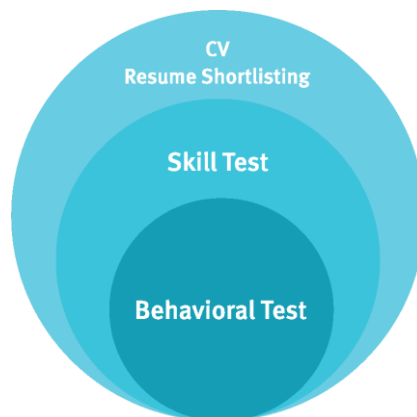
Figure 2. Recruitment phase based on ACI-driven HR recruitment process framework (Figure 1).