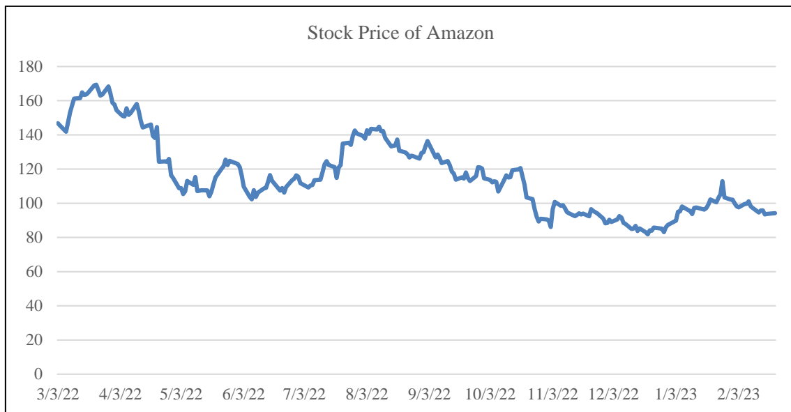
Figure 1. Stock price of Amazon: https://finance.yahoo.com/quote/AMZN?p=AMZN&.tsrc=fin-srch .

As one of the largest e-commerce companies in the world, the shares of Amazon have been strong. As of February 28th, 2023, Amazon's stock price is $93.76 per share. Amazon stock has performed well over the past year, with shares up about 35.53% in the third quarter. But the company's performance is not very good, with net sales reaching approximately $514 billion in 2022, a year-on-year increase of 9%. Amazon posted a net loss of $2.7 billion (Figure 1).