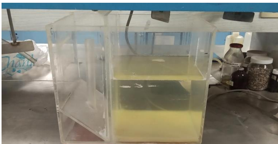
Fig. 3 Conventional treatment sedimentation tank.