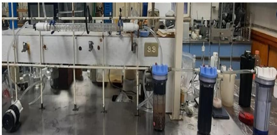
Fig. 4 In-line coagulation and rapid filtration train.