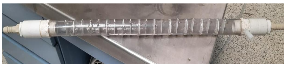
Fig. 5 Static mixer.

The parameters were measured with a direct reading multi-parameter monitor YSI model 556 MPS. The COD was digested in a HACH Reactor and was analyzed with a HANNA Photometer multi-parameter model HI 83399, and turbidity with a HANNA analyzer.