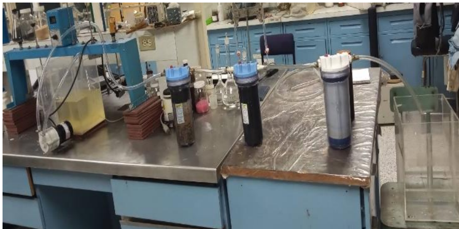
Fig. 2 Wastewater conventional treatment train.