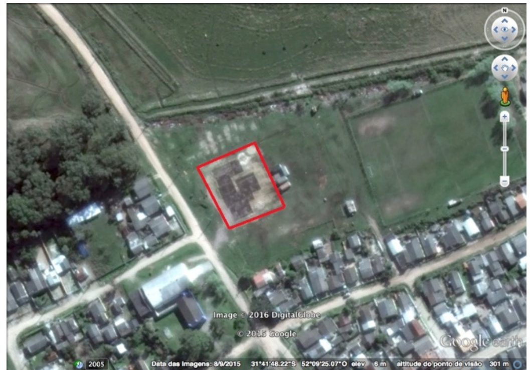
Fig. 2 EMEI Colônia Z3 Lot.