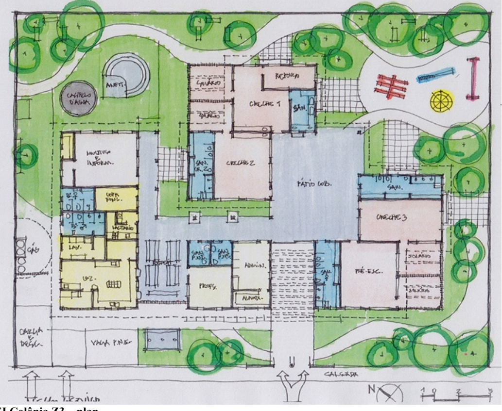
Fig. 4 EMEI Colônia Z3—plan.