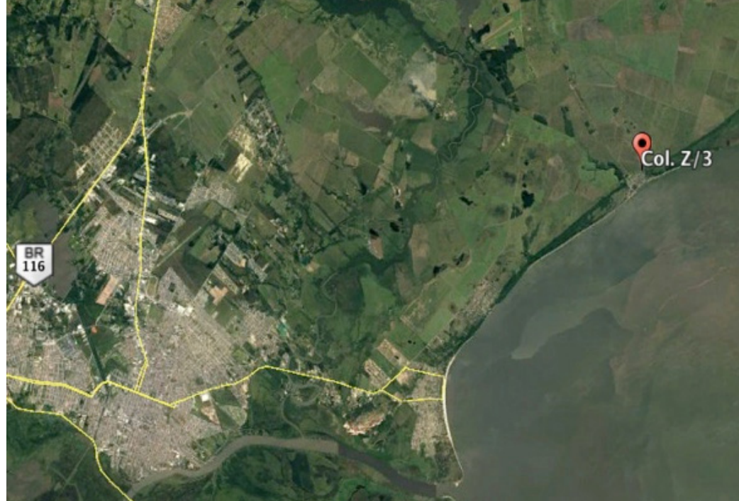
Fig. 1 Location of Colônia Z3.

the EMEI Colônia Z3, a fishermen village in Pelotas, RS, Brazil (Figs. 1 and 2). It is in a rectangular lot of 35 \times 45 meters and maximum declivity of 3%. FNDE's