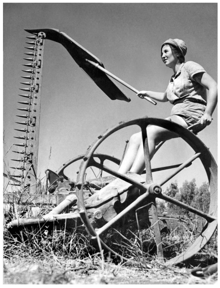
Figure 2. Women training to substitute mobilized men. Kibbutz Ein Hahoresh. Photograph by Zoltan Kluger, 1940. Courtesy of JNF archives.