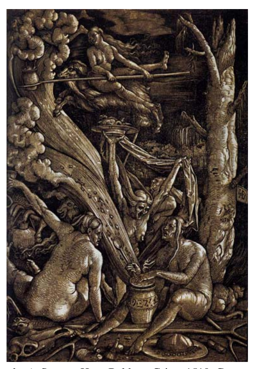
Figure 4. Witches Sabbath (tonal woodcut). Source: Hans Baldung Grien, 1510, Germanisches National museum, Nürnberg.

Both Baldung and Dürer made pictures of witches, though Baldung's are more violent and numerous. The artists were not necessarily personally interested in witches, but their art indicates that they saw the utility of depicting them (Hults, 2005, p. 74). Baldung's witch pictures include paintings, prints, and delicate, meticulous drawings of lewd and pornographic scenes.<sup>39</sup> Baldung returned to witch imagery throughout his career, and suggesting he had a receptive audience. The scale and delicacy of the media and skill of execution suggest that Baldung's witch images were costly and meant for occasional viewing in private or in small groups (Koerner, 1993, 344-351). Viewing such images was good for, in Hults' words, "male bonding" among his elite audience of viewers (Hults, 2005, pp. 61-62, 93).<sup>40</sup> Baldung's pictures gave viewers a chance to feel both entertained and superior.