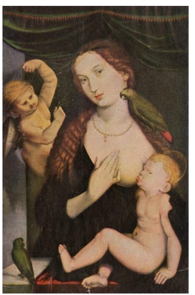
Figure 1. Madonna with Parrots.<sup>3</sup> Germanisches National Museum, Nürnberg.

with her son, to whom she pays no attention. A Ring Necked Parakeet, ( Psittacula krameri ), either a juvenile or a female because of the faint color of the neck ring, gazes up at the Virgin from the lower left corner.<sup>2</sup> The parakeet anchors a diagonal across the body of the Virgin, leading the viewer's eye from lower left to upper right, along the line implied by the Virgin's pale arm and hand, toward the breast and up to the Gray Parrot on the upper right. The Virgin's exposed flesh fills much of the composition, as she positions her right hand at her chest. This arrangement of motifs identifies the birds as attributes of the Virgin, not of Christ. The Gray Parrot rests against her skin, not her garment, making the contact all the more sensual. The vulnerability of Mary's exposed neck, her beckoning glance, the attention drawn to her skin, not to mention the menacing expression of the angel in the upper left corner, disconcert the beholder.