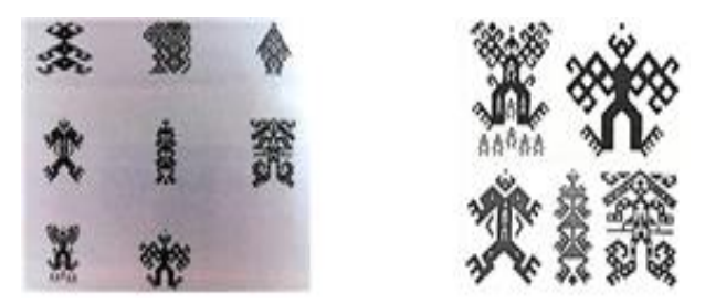
Figure 1. Frog pose human figure pattern (Source: Mao, 2017, p. 26).

Figure 1 illustrates a frog pose human figure pattern. As the name suggests, it retains some external characteristics of a frog, such as a diamond-shaped body and limbs bent like a frog's. Some designs even include webbed feet, yet the basic human-like image remains very evident.