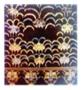
Figure 8. Kapok pattern (Source: Mao, 2017, p. 31).