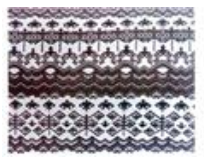
Figure 9. Flower pattern (Source: Mao, 2017, p. 31).

Geometric patterns. Geometric patterns (幾何紋) are the most prominent motifs in Li Jin, reflecting the rich imagination and profound cultural significance of the Li people. According to Shen Lin (2008) in Research on Clothing Patterns of the Chuxiong Yi Nationality and Their Modern Application, geometric patterns refer to a general term for non-representational, rule-based designs. These patterns incorporate stylized transformations and exaggerations of natural landscapes and are composed of basic elements such as dots, lines, and planes, adhering to principles of formal aesthetics to create iconic designs.