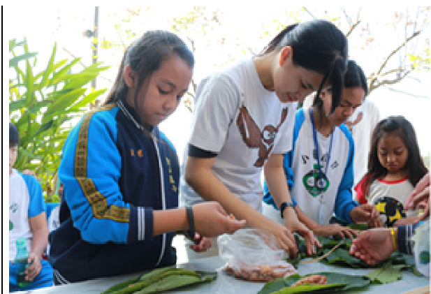
Tribal schoolchildren teach team assistants how to make Chinafu.