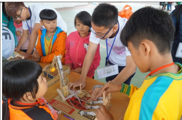
Excavator and table tennis:

Divided into two parts: ferrofluid and electromagnet. We add oleic acid to the iron powder, so when the magnet attracts the iron powder, the fluid will be sucked away together and presented in the form of a maze, allowing children to guide the ferromagnetic fluid to the end with the magnet in their hands. The electromagnet is to let the children absorb the paper clip with the electromagnet rod in their hands, and cross the checkpoints we set.