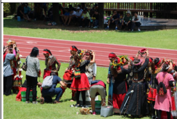
In the ceremony of the coming-of-age ceremony, you must introduce yourself in the ethnic language and change into clothing representing adults.