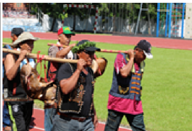
The hunter carries the prey from the mountain.