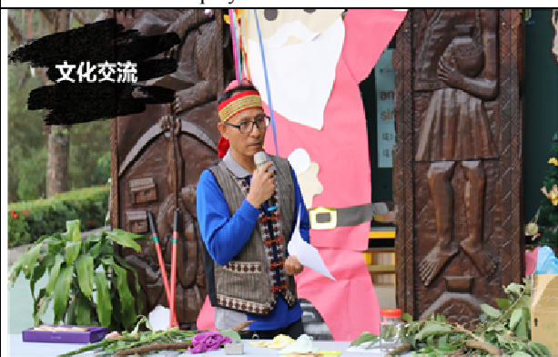
Tribal elders explain the functions of medicinal plants.