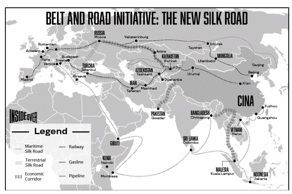
Figure 1. The Belt and Road Initiative (Source: Escobar, 2018).

Mainly, it is regarding an infrastructural investment plan that aims to develop the connectivity and the collaboration between China and at least other 63 countries localized in an area that represents one third of world GDP, which includes at least the 70 percent of the population and owns over 75 percent of the global energy reserves (see Figure 1). On the other hand, instead, marine director will allow Chinese goods to reach the Mediterranean through Suez, extending up to East African coasts and the Maghreb and the rest of Asia through South China Sea. In addition to the two roads, Chinese government in January 2018 announced the intention to create a polar silk road that should be developed along three routes through Arctic: one passage to the northeast, one to the Arctic Ocean, and the last one to the northwest.