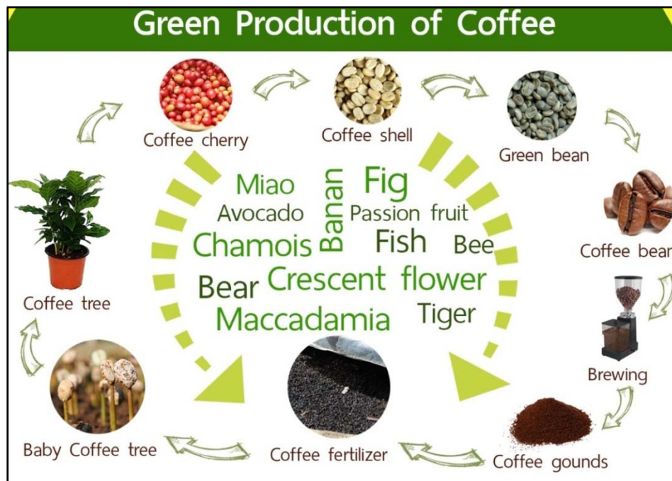
Figure 4. Green production of Pamieng coffee.

The expected outcome of this research study was to map the value chain of Pamieng Community coffee plantation in relation to the green production, this in addition, reflects the understanding of both the researchers and the community. As shown below, it can be seen that coffee tree produces coffee cherry, product from coffee tree that contains pectin, which according to James Hoffman (2017) causes damage to living things such as plants. The coffee cherry then turns to coffee shell when dried. The green bean from coffee shell can be processed into coffee bean. The coffee ground left from brewing can be used as a fertilizing product for baby coffee tree, and the cycle repeats.