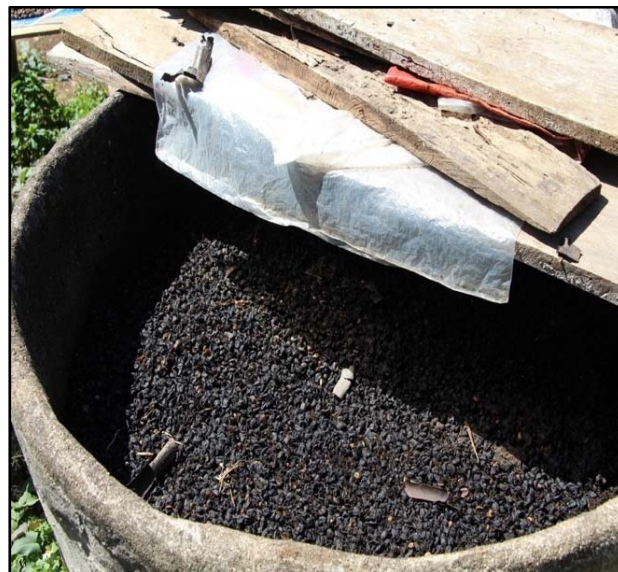
Figure 3. Fertilizer from coffee's shell.