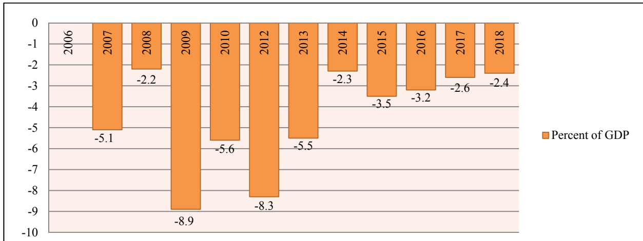
Figure 1. Jordan government budget.

One of the main financial problems in Jordan is budget deficit, which means that the expenses of the public sector exceed its revenues. According to Trading Economics (2019a), Jordan recorded a government budget deficit equal to 2.40% of the country's Gross Domestic Product (GDP) in 2018. The budget balance averaged -1.22 % of GDP from 1990 until 2018, reaching an all-time high of 10.11% of GDP in 1992 and a record low of -8.90% of GDP in 2009. Figure 2 represents Jordan government budget in terms of budget deficit over the years of 2007-2018.