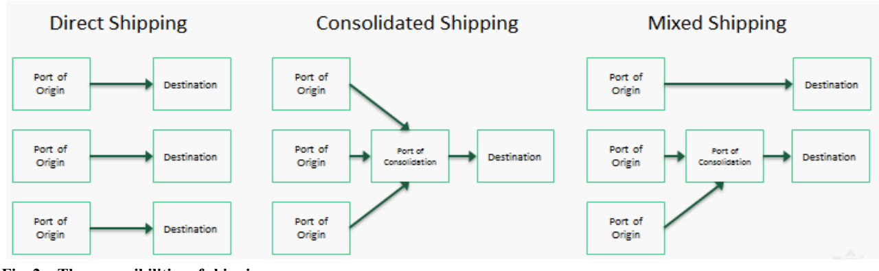
Fig. 2 Three possibilities of shipping.

We propose an integer programming model for Container Size Optimization (CSO) problem that optimizes the carbon footprint by considering both the selection of ideal sizes of containers for the shipment volume. The model also determines the optimal number of containers that satisfies the shipment volume. In CSO, we assume that the shipments can only be shipped directly from ports of loading (i.e., a port in China) to ports of discharge (i.e., in U.S) via sea. The idea is that it is more carbon efficient to use a set of containers which is just enough for the shipment volume as different container sizes has different carbon emission factors.