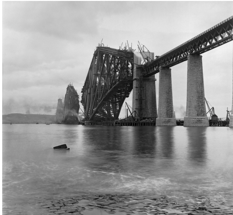
Fig. 1 Evelyn George Carey, Forth Bridge nearly completed from the Hawes Pier on 15 April 1889.

widely acclaimed; the photos provided an accurate recording of this notable happening, from the inauguration of the site, to the laying of the three large columns; from the first images of the small island of Inchgarvie located in the middle of the river and used as a foundation for one of the imposing cantilevers, to the work carried out to complete the railroad track crossing the bridge. What especially stood out in some of the photos was the metal framework itself, whether it was the large steel tubes riveted and then carefully checked over in the workshop, or the trusses that were employed in the laying of the foundations; still today, the memory of the photo lens conveys an extraordinary message, telling the story about a project based on willpower and commitment, and progress at the height of its creative expression. While the bridge was being built, between 1883 and 1890, there was bitter controversy within the scientific community, resulting from the anxiety that continued to linger long after the collapse of the Tay Bridge. The memory of the 75 victims of the disaster that had taken place in 1879 while the train was crossing the bridge was still a very vivid one. For this reason Fowler and Baker took