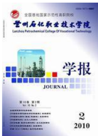
Figure 1. Journal of Lanzhou Petrochemical Vocational and Technical College , 2, 2010.

Some academic journals try to capitalize on the cover to provide readers with much more information, listing a number of award-winning information, even some awards obtaining many years ago, which ignores the fatigue problems of readers. For example: In Journal of Lanzhou Petrochemical Vocational and Technical College , there was a list of the outstanding awards on its cover. 1