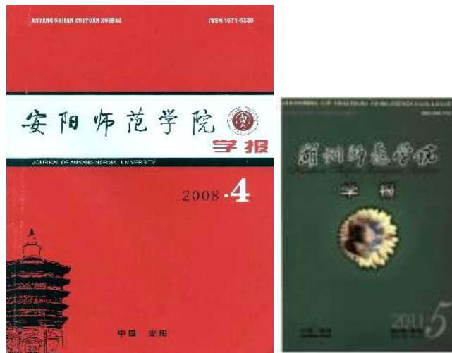
Figure 3. Journal of Anyang Normal College , 4, 2008; Journal of Huzhou Normal College , 5, 2011.