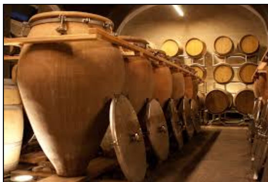
Figure 2. Foradori organic winery in Italy.

There are various ideas and technologies regarding the implementation or legal regulations for orange wines. In 2013, the qvevri technology was inscribed on the UNESCO Representative List of the Intangible Cultural Heritage of Humanity (Unesco 8.COM 8.13 Description, 2013) and since then there have been many winemakers in Europe (Italian, Slovenian, Spanish, Hungarian) probing this strange technology (Figure 2) (Brincat, 2014).