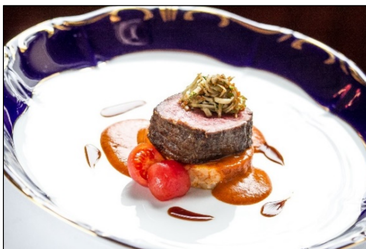
Figure 4. "Mágnás gulyás" in Gundel Restaurant.

The most important features, as positioning factors of the orange wines are: