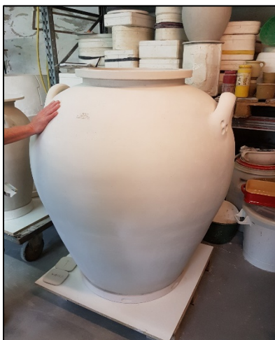
Figure 1. Amphore from Légli Pottery in Hungary.

The ancient Georgian people used special clay pots, so called qvevri and put grapes into these vessels. After the long fermentation period, they pressed the grapes and put back into the amphores (Figure 1).