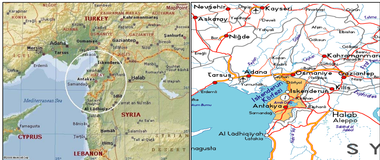
Figure 2. The map of Hatay and neighboring cities and countries.

by Syria to the south and east and the Turkish provinces of Adana and Osmaniye to the north. It is estimated that 420,000 Syrians have been currently living in Hatay (Hatay Governorship, 2016). According to official figures, 5% of Syrian population in Hatay lives in refugee camps whereas 95% of majority lives in the urban life which shows the lack of infrastructure and humanitarian aid in Hatay (Hatay Migration Administration, 2016).