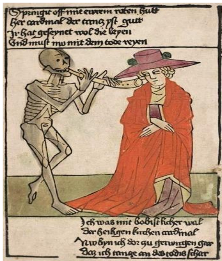
Figure 1. Totentanz , 1455, blockbook from the Codex Platinus Germanicus 438 (132r) at the University of Heidelberg, Germany.

The concept of pairing living figures with death continues throughout the 16th century and into the 17th in Europe.