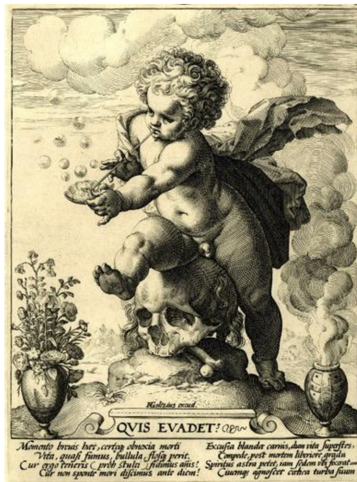
Figure 12. Hendrick Goltzius, Quis Evadet? II (Homo bulla est) , 1590-94, After Agostino Carracci. Rijksprentenkabinet, Amsterdam (No. RP-P-OB-10.228).

In a more daring print, Goltzius represented also a panoramic landscape whose lower background illustrates a seascape and cityscape, while the foreground represents the top of a mountain (see Figure 12) (De Grazia, 1984). 13 Here, Goltzius created another Herculean-type of putto who does not rest but eagerly rides on a skull