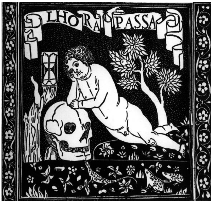
Figure 9. Anonymous, Italian Renaissance woodcut, L' Hora Passa , 1490. Bibliothèque Nationale, Paris.

Imageries of Homo bulla est (Man [the individual] is a bubble) are depictions of an open landscape where a putto or a naked youth rests on a skull while blowing soap bubbles. This imagery is commonly illustrated in European emblematic books and prints of the 16th and 17th centuries (Sutton, 2012; Cheney, 1992). This essay briefly examines the complex symbolism of air, as an ephemeral state, as a reference to the terrestrial passing of life ( l' hora passa ). In an anonymous Italian Renaissance woodcut, L' Hora Passa (Time Passes), 1490, at the Bibliothèque Nationale in Paris (see Figure 9), the motto l' hora passa , inscribed in a scroll at the top of the imagery, illustrates this concept (Janson, 1937) 7 . The scene represents, perhaps for the first time in Italian Renaissance art, the depiction of an hourglass with a wingless putto. The naked youth intensely gazes at the hourglass while resting on a large skull. He is meditating on the passing of time in a landscape surrounded with blooming and dead trees, scattered flowers, and insects—frogs and lizards (Janson, 1937; Seznec, 1938; Labno, 2016) 8 .