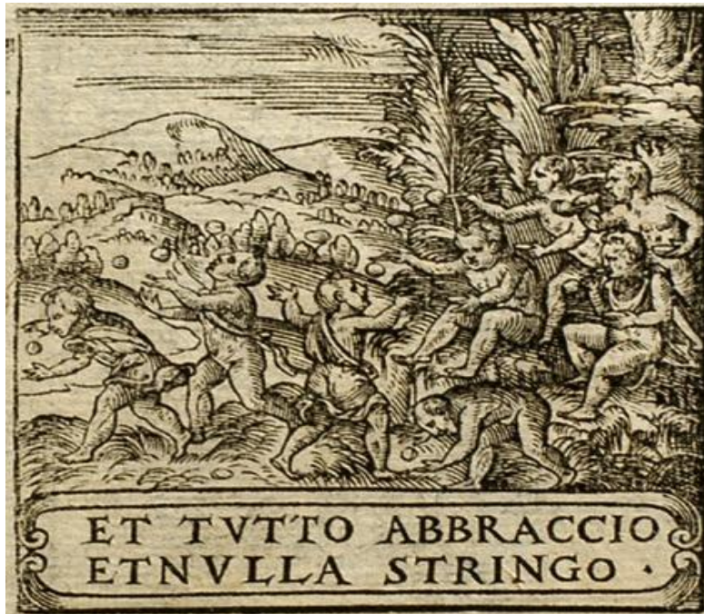
Figure 13. Hadrianus Janius, Emblem XVI, from Medici Emblemata (Antwerp: Christophe Plantin, 1565).

1994), while the scallop shell as a container of water and soap is a Christian iconographical symbol for purification commonly used in baptismal rituals (Metford, 1983). The scallop shell is also a symbol of pilgrimage referring to the journey of the human soul to achieve eternal salvation while traveling on the Earth (Cooper, 1987).