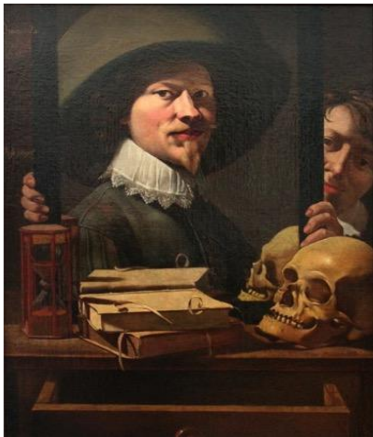
Figure 8. Antoine van Steenwinkel, Vanitas Portrait of the Painter , 1680. The Royal Museum of Fine Arts, Antwerp, Belgium (Photo credit: Public domain.commons.wikimedia.org).