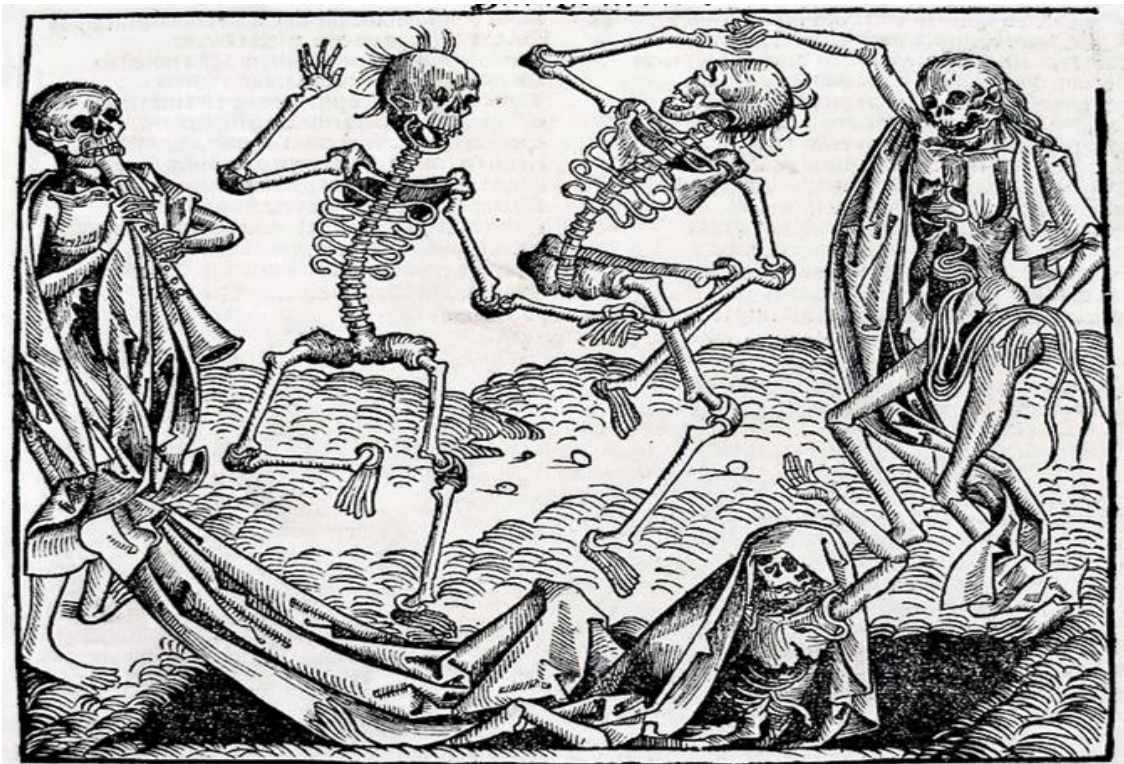
Figure 3. Michael Wolgenut, Dance of Death , 1493, woodcut from the Nuremberg Chronicles.