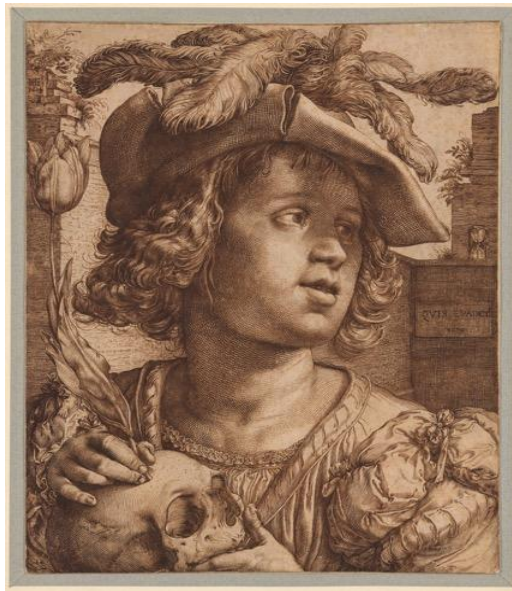
Figure 7. Hendrick Goltzius, Man Holding a Skull and a Tulip , 1614, drawing. Pierpont Morgan Library, NY. Photo credit: Pierpont Morgan Library, New York (Inv. III.145). Download image: 128202v-0001.jpg.