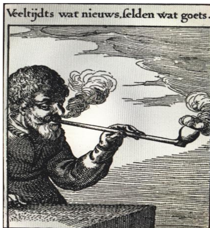
Figure 14. Roemer Visscher, Emblem X, from Sinnepoppen (Amsterdam: Claes Jansz Visscher, 1614).