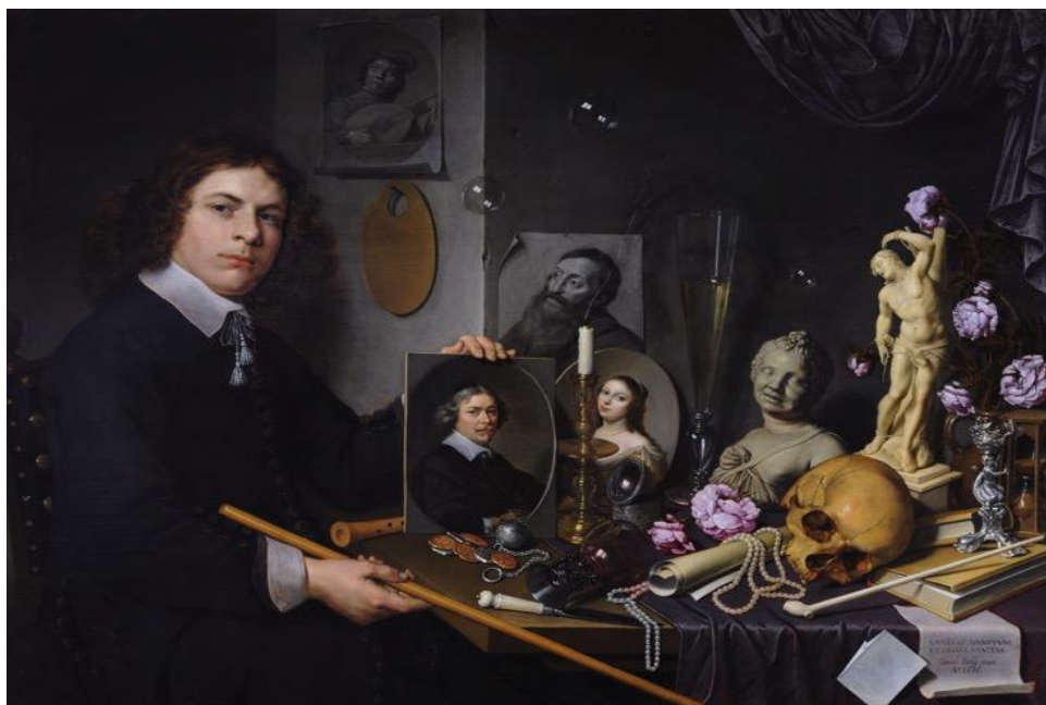
Figure 6. David Bailly, Vanitas With a Self-Portrait, 1651. Stedelijk Museum De Lakenhal, Leiden.