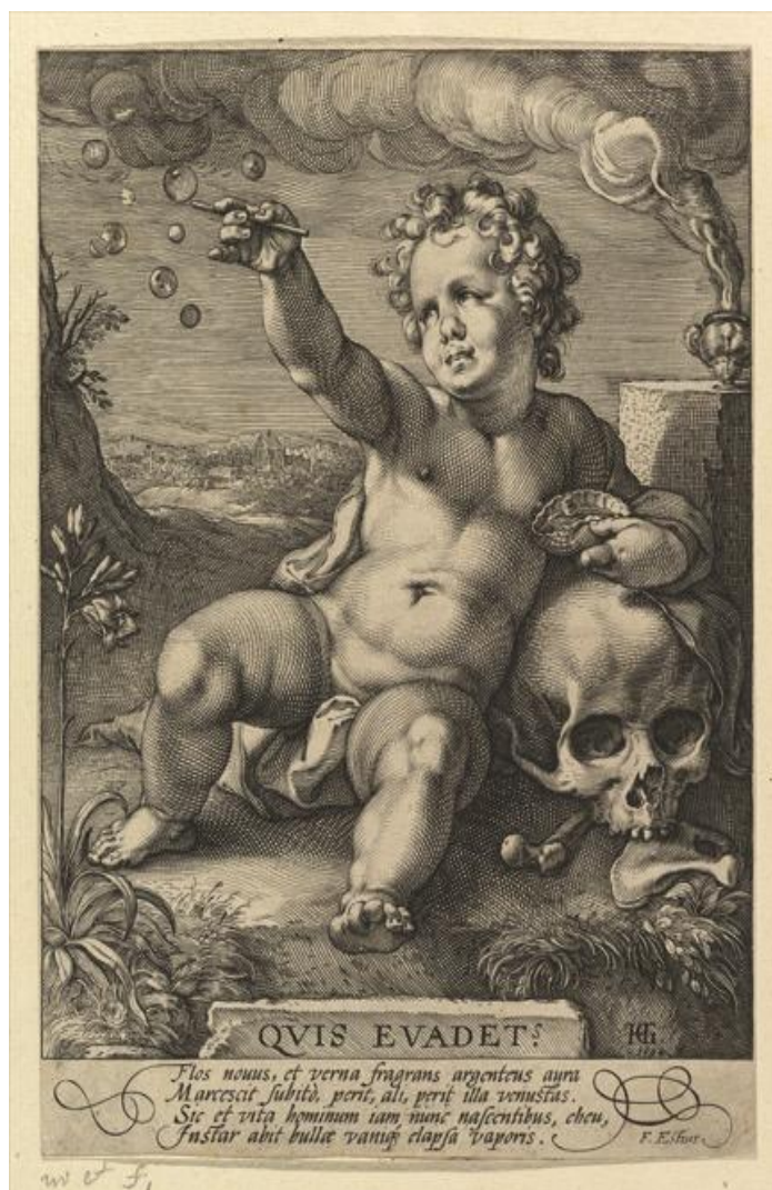
Figure 11. Hendrick Goltzius, Quis Evadet? I, 1594. Allegory of Transience (Homo bulla est). Metropolitan Museum of Art, New York (51.501.4929). The Elisha Whittelsey Collection, The Elisha Whittelsey Fund, 1951.