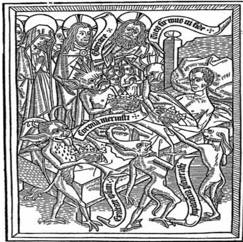
Figure 2. Master E. S., Ars Moriendi , 1464, woodcut from the Netherlandish Latin Text. Bibliothèque National of Paris (Photo credit: Public domain.wikipedia.org).