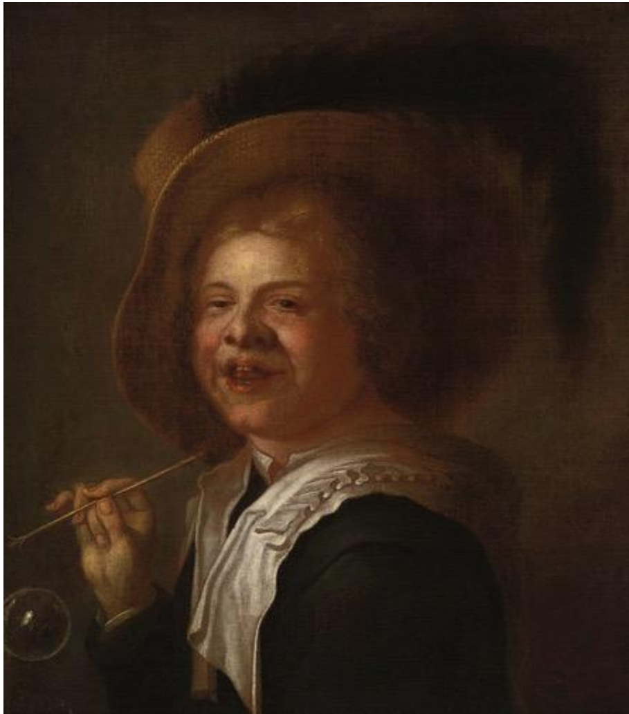
Figure 15. Judith Leyster, A Boy Blowing Bubbles , 1655. Christie's London, 24 March 2009, Lot 94.