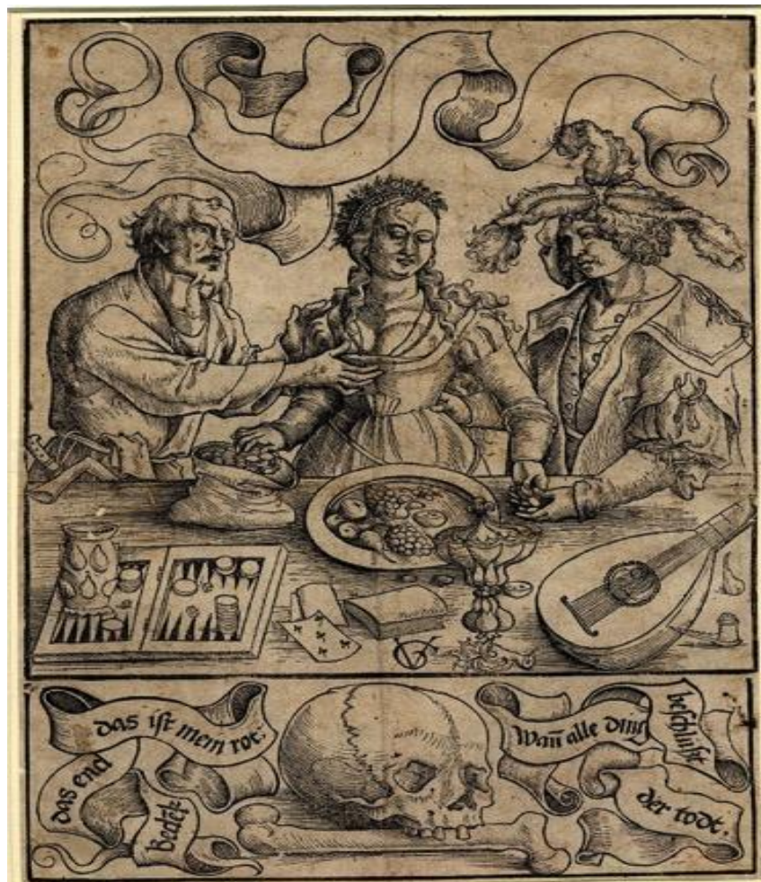
Figure 5. Urs Graf, Vanitas or Mercenary Love, 1511, woodcut after Hans Holbein the Younger. British Museum, London.