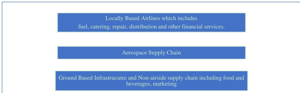
Figure 2. Schematic Diagram of Value Chains in Indian Aviation and Air Transport Services.

This value addition which is foremost inputs of the airline business is in the realm of energy and aircraft and its maintenance. Apart from those core inputs, the airline business also banks on other services, such as food and beverages services, trade, insurance, and other services. ICAO (International Civil Aviation Organization) (2013) in its assessment of the aviation value chain suggested including aircraft leasing services and manufacturing, air navigation services, maintenance repair and overhaul services, fuel supply, ground handling, and systems for selling tickets including online systems. For Indonesia, fuel consists of 35 per cent of the value addition followed by warehousing transport services, administrative services, retail trade of vehicles, and food & accommodation services. Manufacturing food and beverages consists of 5.7 per cent of the total value chains. 21 US$4.8 bn 22 is the value-added exports by India to the world in terms of airlines hospitality services which could be one of the components of value addition that can be extended to Indonesian market.