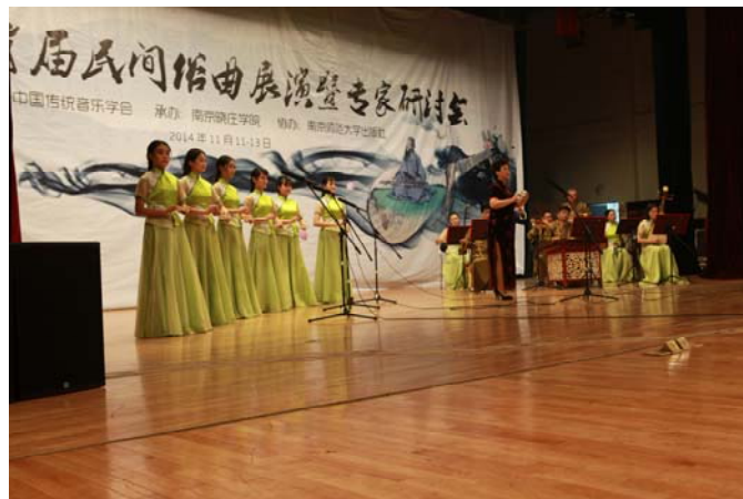
Figure 2. Actors participate in the first national folk music performance in Nanjing (2014-11-12).

Today, as a kind of entertainment folk music, HZFMT Circulates among the general public. It is accompanied by musical instruments such as erhu, sanxian, banhu etc. There are two very special dinner services to be used as rhythm instruments which are a small dish and two wineglasses. An accompanist with a pair of iron