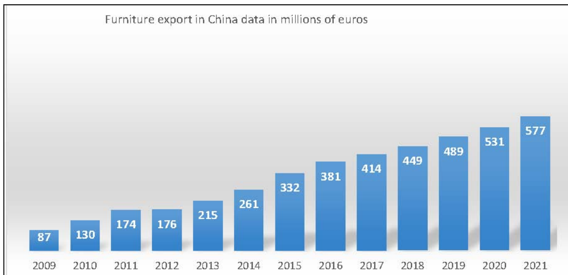
Figure 1. Export to China (Time series 2009-2016 and forecast for 2021; Figures in millions of euros). Source: Our processing by Federmobili (2017).

(+22%) among the main end markets. The purchases of furniture and design furniture by the Chinese are showing a real boom with sales of over 300 million euros (Figure 1).