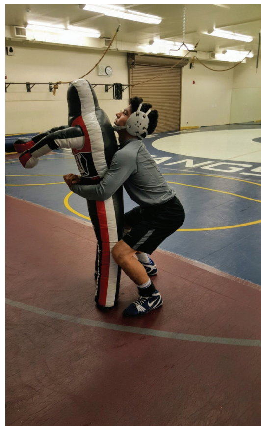
Fig. 1 Starting position for dummy throw (mass 31.75 kgs).

Multiple statistical approaches were used to quantify the test-retest reliability of the LWAPT (trial 1 vs. trial 2). Interclass ( r ) and intraclass coefficients (ICC) of reliability were calculated as well as the standard error of the measure ( SE_m ). Scatter diagram and Bland-Altman plots were constructed to examine linearity and uniformity of error. The data were also