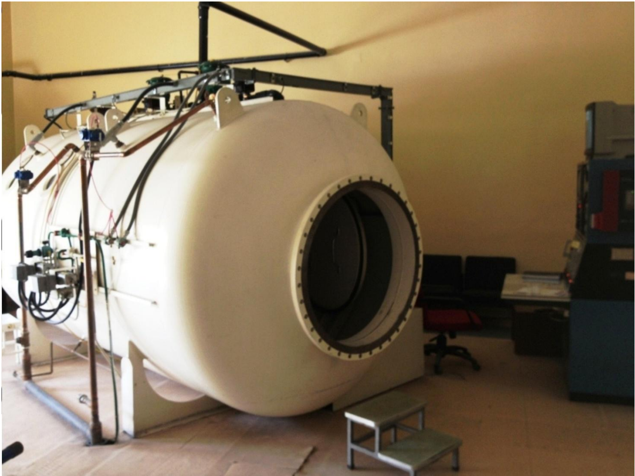
Fig. 2 HBOT device in our center that has maximum 5 patients and 1 observer capacity.