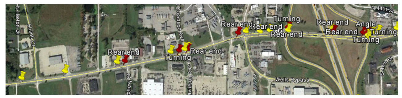
Fig. 1 Crashes plotted in mount Vernon, Illinois.

same or similar roadway with the intersections having similarly characteristics. This step aimed to eliminate factors known to impact the safety of a roadway, such as driver behavior and changes in traffic volume or patterns. Table 1 lists the ADT of the coordinated route, where it is evident that locations with higher ADT's typically experience higher crash rates. To account for this effect the caparison site was selected to have the same or similar ADT, the comparison method will account for variations between treatment sites, as the ADT changes at the treatment site it also changes at the comparison sites negating the perceived impact of crash reduction caused by lower traffic volumes. When possible the same number of sites were selected for comparison, however two cities did not have comparison sites available. Comparison sites not directly adjacent to the treatment sites were selected to prevent any spillover effect identified in the literature review, sites were selected some distance away excluding at least one signalized intersection between the treatment and comparison sites.