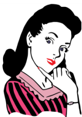
Figure 5. 11.09 a.m. 16/8/2017.

The chart shows husband in S fire sector supports wife yin wood in NE earth sector, means husband still loves wife. However, the mistress yin fire in E wood sector supports husband in fire sector. This means the mistress also loves the husband. How do we handle this. This is the technique of look forward to a future date with a favorable Qi Men chart and enhance the energy of that future chart to solve the problem. Now let us examine a future chart base on the moment of 13:09 pm 21/9/2017.