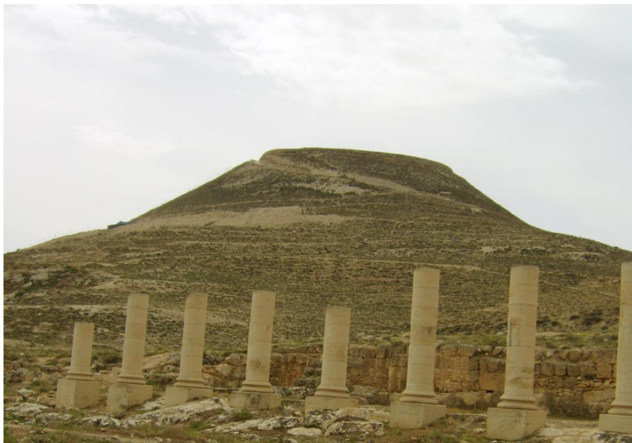
Figure 1. Herodium from the Pool Complex. 8

Why did Herod choose this site near the Judean desert to build a multipurpose complex? It was near this site in 40 B.C.E. that he fought the defining battle of his life. "In the very place where he defeated the Jews he later built a splendid palace surrounded by an extensive complex, and called it Herodium" (JA 14.359-360). That year the Parthians (from modern day Iran) invaded Judea and took Jerusalem. Mattathias Antigonus, the last Hasmonean king, rebelled against his Roman overlords and joined forces with the invaders who were Rome's traditional enemies. Herod refused to join the revolt.