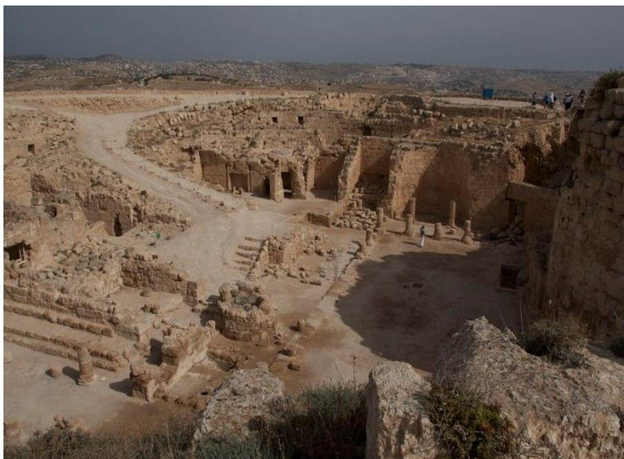
Figure 3. Interior of the Palace-Fortress 25 .

The palace itself was divided into two equal parts by a central dividing wall. On the eastern side of the wall Herod created an enormous courtyard, open to the sky and planted with a beautiful garden (Figure 3). 24