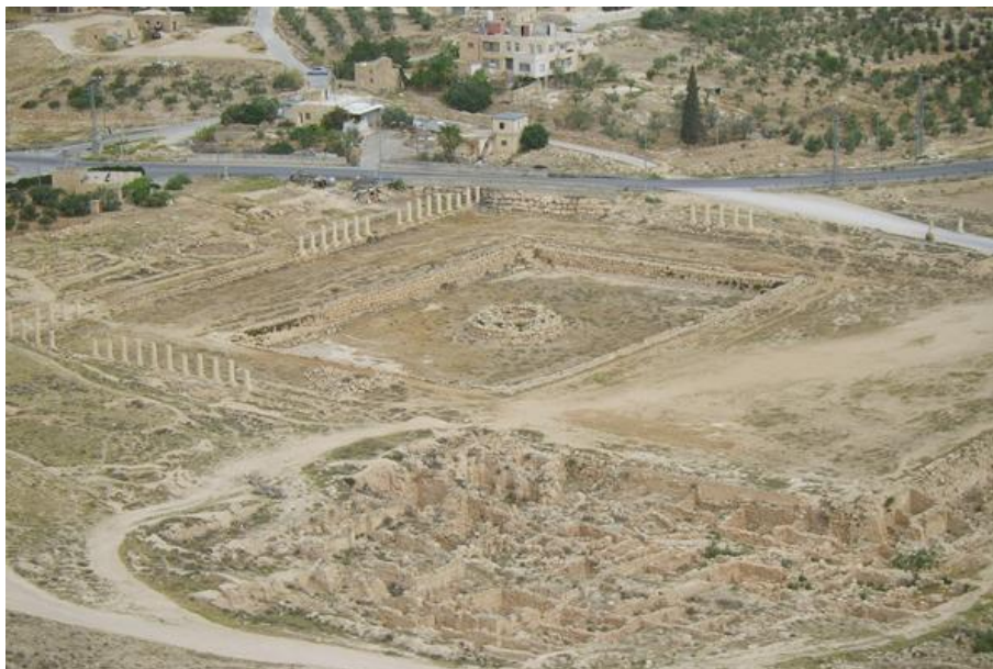
Figure 4. The Pool Complex Lower Herodium 35 .

south-western side, the rest of the surface was built on top of a terrace to bring up the level of the land and ensure the pool area was flat. Its entire surface was covered with hydraulic lime mortar. 34 In the centre of the pool was a circular structure like an island. The pool served as a reservoir for Lower Herodium, a swimming pool and for boating (Figure 4). This sight would have been very impressive to anyone who visited the area, seeing an abundance of water and beautiful gardens at the edge of the desert.