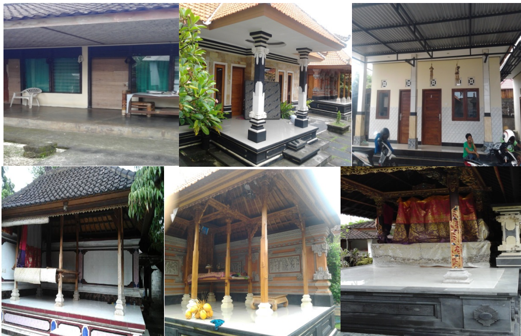
Figure 5. Houses and traditional, modern or postmodern (Document: Mutria, December 17, 2016).

The houses and home temples in Kutuh village community have undergone the change from traditional to modern or postmodern. These changes happened about 2011 when with the existence of the tourist Pandawa beaches of the some people in Kutuh villagers sold their lands from reasons such as Cremation ceremony, renovating home temples, or to buy the cars. (Interview, December 29, 2016)