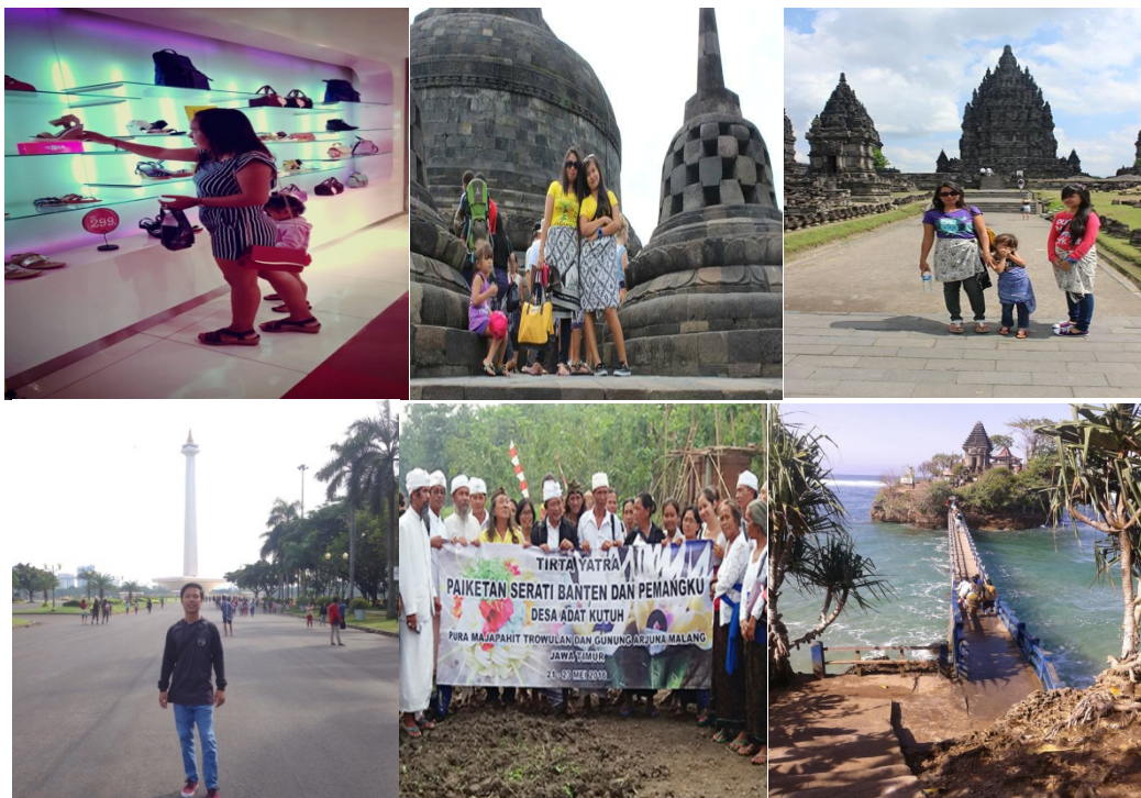
Figure 3. A walk to the mall, to the sightseeing to Tirtayatra and various Temples in Bali (Document: Mutria, January 23, 2017).

Before sold the their lands at the community had not many pelesires at the long holidays or school holidays, they spent their time in the village onlysbut after sold their land it was become they changestaid at the hotels just how it feels, if they staid at the hotels, they shopping, went to sight seeingthey made group tour to Tirtayatra with the their vacation. (Interview, January 23, 2017)