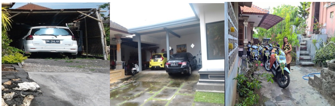
Figure 4. Ownership of the means of transport (Documents: Mutria, November 16, 2016).

After most people in this village sold their lands, and could bought their cars, and after it's then renovated places of worship, homes, or vice versa. There are the men who possess 3 cars in their house, but (Imaging) simple car Fund is not rented out only for private course. (Interview, November 16, 2016)