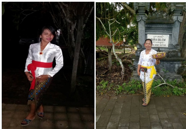
Figure 1. The difference in the patterns of clothing to the temple past and present (Documents: Mutria, April 16, 2017).

Many member at current community in are using trendy kebaya as which are woman's clothing, these become more fashionable, transparan and wear short sleeves, use cloth with slightly higher or seem. Given the custom in dressing these wears to the temple is the characteristic of Hindus in Bali, gracefully if someone does look to the temple with the clothing in such way and use the Tuck purse in her shawl to save money and mobile. But it's good if someone went to the which intended to present themselves to the Hyang Widi Wasa with clean and polite clothes as well as in accordance with the teachings that were in the order to religion and culture. (Interview, April 16, 2017)