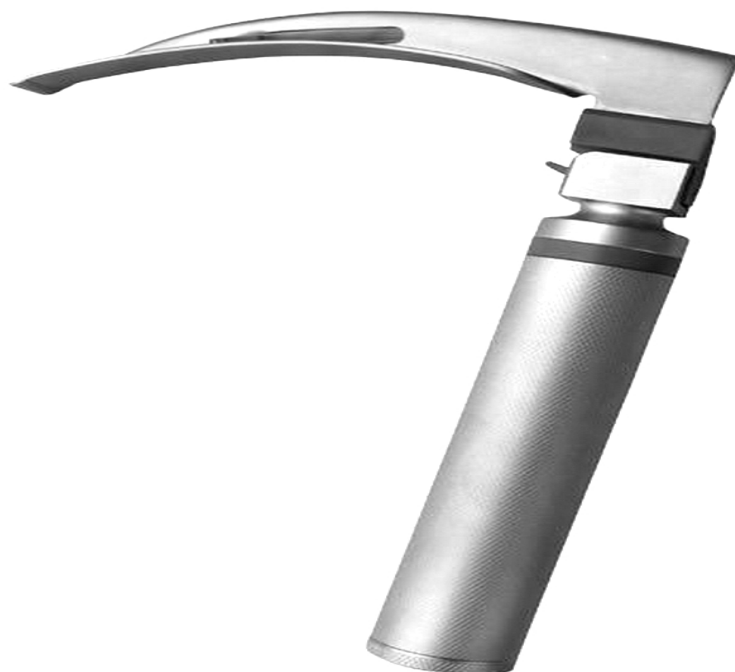
Fig.1 Macintosh laryngoscope * 1 .