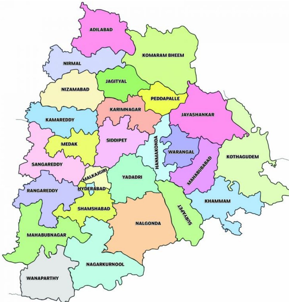
Figure 3. A map of state of Telangana.

This was not only a revival of their faith in themselves but also an opportunity for them to revive their systems of management of their own resources. They started desilting and restoring the tanks built by Kakatiyas centuries back. The new state government selected by people democratically took the initiative and the masses started participating willingly. They have rejuvenated almost 8,000 out of 45,000 plus tanks built by their predecessors through a very wonderful initiative known as Mission Kakatiya.