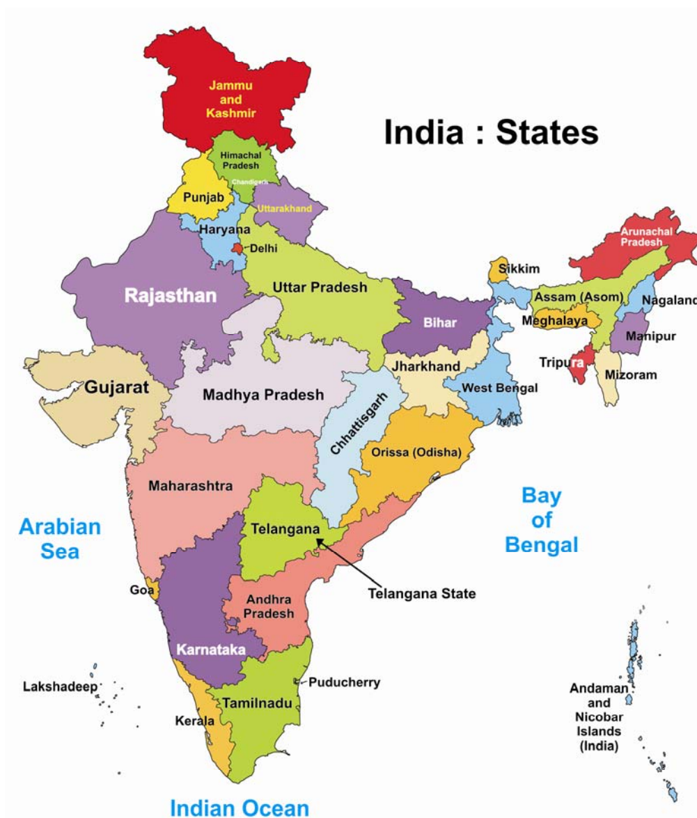
Figure 1. Map of India with all the states with special reference to Telangana state in South India.

The same policy was followed even after India got independence from British in 1947. Post-independence Telangana was included in Andhra Pradesh along with the coastal areas where it experienced that the resources and the wealth of the state were unequally distributed and there was disparity in development. People of Telangana had to fight for their rights.