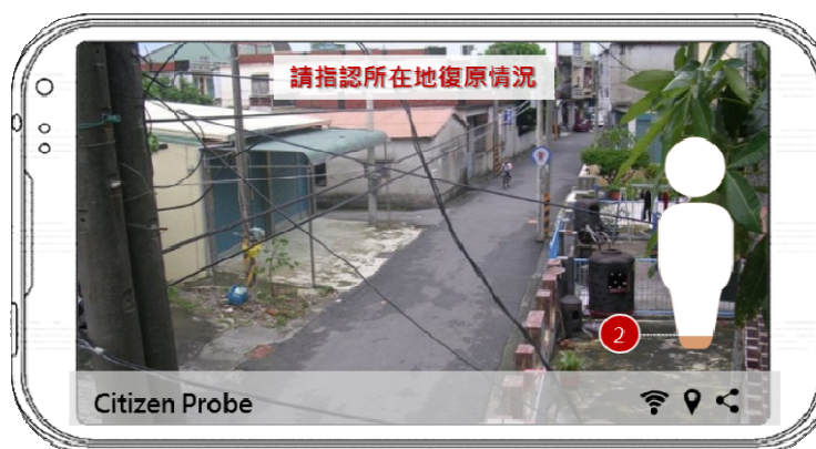
Fig. 3 Reporting flood recovery on Citizen Probe.