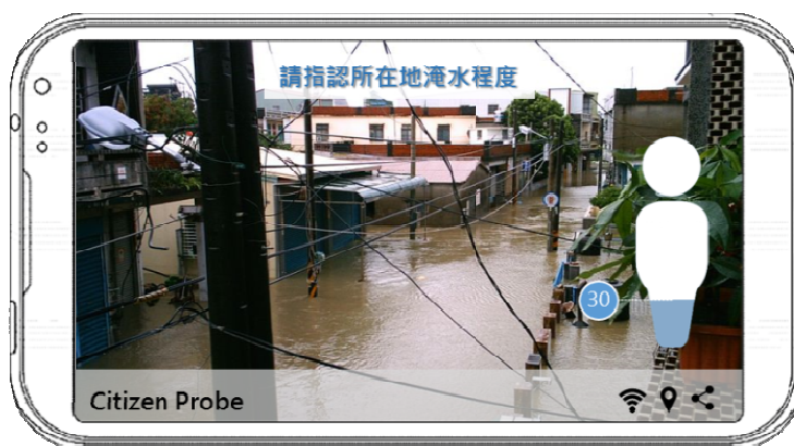
Fig. 2 Reporting flood height on Citizen Probe.