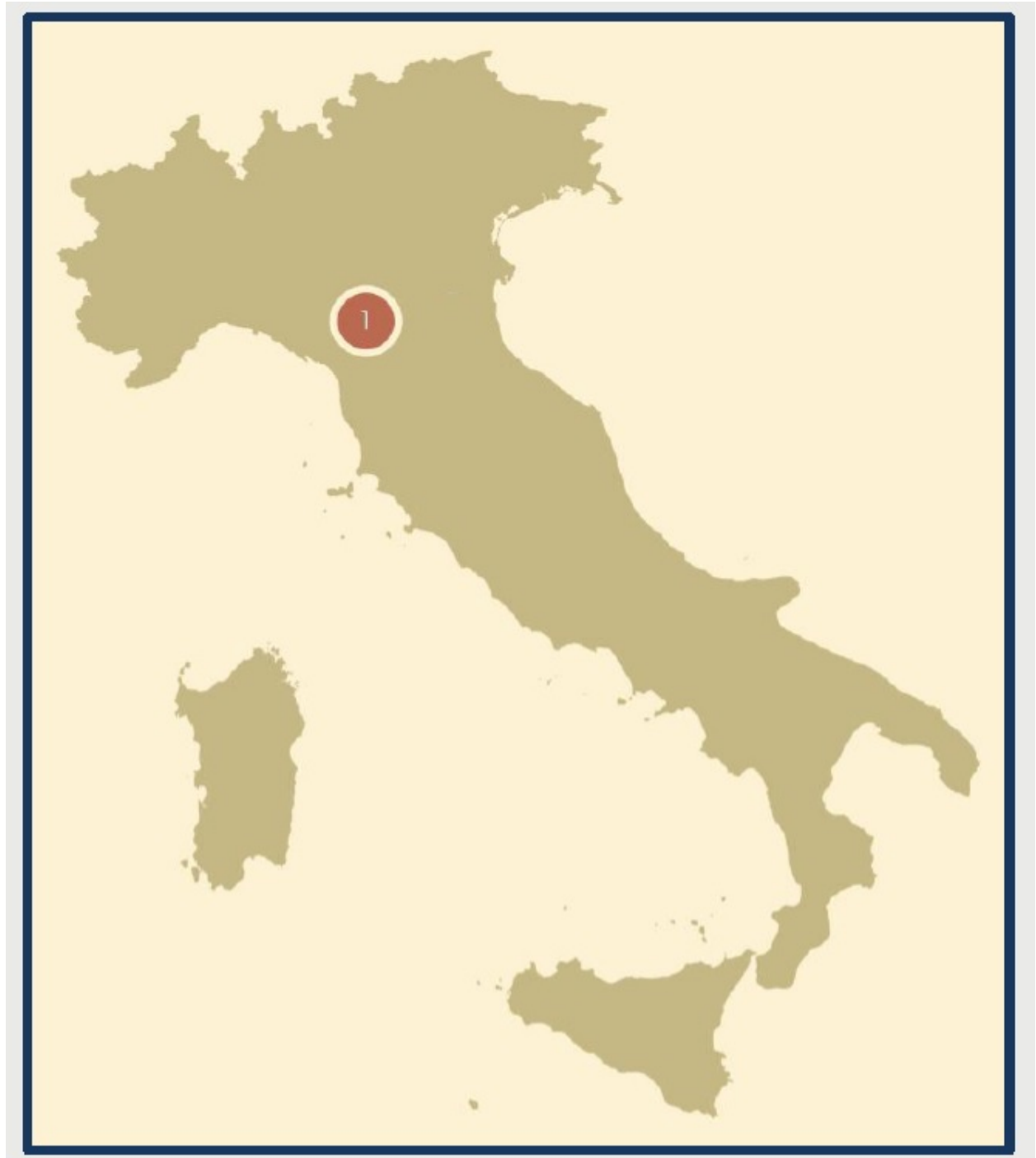
Fig. 2 Index map of the area under study.

structures in relation to crustal dynamics, where deformations are induced by movements that originate in the depths of the Earth. The case study set out to reconstruct the current composition of the Alta Val Magra basin (Fig. 2) in the North-Eastern Apennines (Italy), particularly as regards its extensional structures