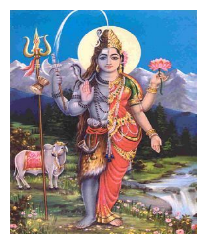
Figure 1. Androgen Shiva.

As noted by Mark Twain, cited earlier, all people, regardless of their sexual orientation, were considered to be a valuable part of human race, a priceless part of the cosmos. Historical evidence indicates that homosexuality has been prevalent across the Indian subcontinent throughout history, and that homosexuals were not necessarily considered inferior in any way until about the eighteenth century (Nanda, 1998). After Puranic and Tantric religion (300-700 A.D.), the God Shiva began to be depicted as Ardhanari-Nateshvara "the Androgen Dancing Lord". Also, temples of Khajuraho in Madhya Pradesh, India, built around 1100 A.D., depict homosexuality. In Gujarat, a temple is specifically dedicated to the goddess "Bahuchara Mata" who serves as the goddess for the "third gender" which includes different forms of sexuality: lesbian, gay, bisexual, and transsexual.