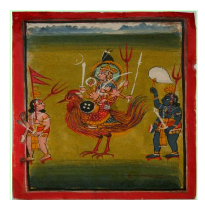
Figure 2. Bahuchara Mata, Patroness of Hijras (LGBT).

India, along with Pakistan, Nepal, and Bangladesh, has legally recognized transgender people as third gender. The Supreme Court in National Legal Services Authority vs. Union of India and other cases decided on 15 April 2014, that the category hijra designated "as neither man nor woman", and transgender constitute a third gender in law.