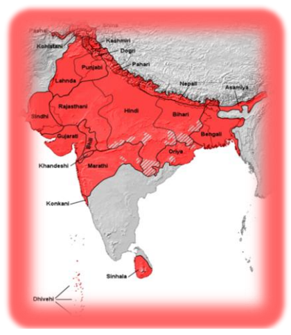
Figure 3: Aryan Languages (Menon, Hartsock, & Johnson, 2010).

The Indo-Aryan group, notably prominent in Northern India (but also extending beyond the political borders of India), includes Hindi, Hindustani, Gujarati, Bengali, Oriya, Assamese, Konkani, Marathi, Punjabi, Sindhi, Magadhi, and Maithili as some of the ethno-linguistic populations that have sizeable groups of religious Hindus.