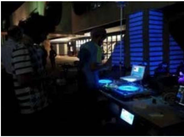
Figure 4. Bits in (re) building, 2015, Victor Valentin. Interactive Performance involving music and lights (Copyright by the authors).

The exhibition included the participation of performance artists as Victor Valentine, with his sound visual computing performance Bits in (re) building (Figure 4).