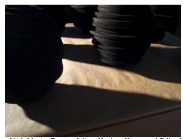
Figure 2. Sound Analogies, 2015, Monica Tavares, Juliana Harrison Henno, and Felipe Merker Castellan. Additive manufacturing, sensors and controllers (Copyright by the authors).

Sound Analogies (Figure 2) is a sound installation comprised by a mobile that has eight components whose forms were established poetically by the translation of sound into 3D volume. Each of the components of the mobile (represented by the translation of sound into form) has a built-in speaker to reproduce a sound texture that varies continuously. Both, the sound texture and the 3D mobile components, are generated from the same sound material. Therefore, the sound and shape constitute a relationship of mutual interdependence (Tavares, 2015). Combining different media such as picture and sound, authors claim the aesthetic information can be perceived both in form and in sound; therefore, recognizing its poetic meaning.