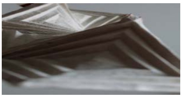
Figure 1. A-Paper Garden: Pomegranate and Jewish Slipper Tree, 2015, Marília Bergamo. Hard paper, wires, sensors and controllers.

Figure 1 shows a detail of an object, which produces sounds and lights when in contact with another object of the whole system.