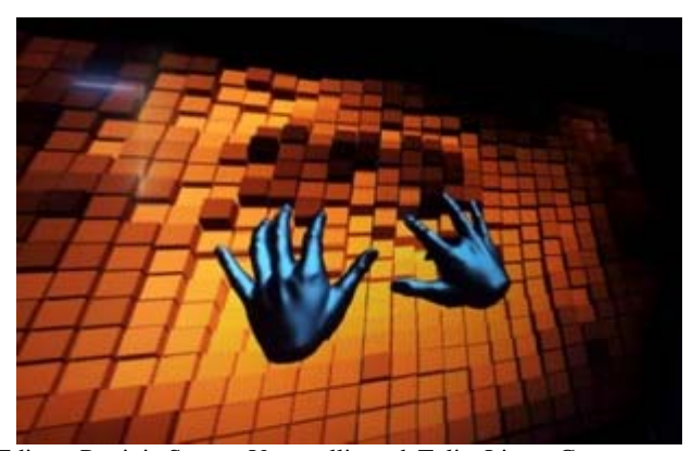
Figure 3. Gestus, 2015, Edison Pratini, Suzete Venturelli, and Tulio Lima. Computer art, sensors and controllers (Copyright by the authors).

Gestus (Figure 3—artwork created especially for this exhibition) presented to visitors the opportunity to experience in real time the creation of sounds and images through gestures of their own hands. A tracker device for computer vision (Leap Motion) recognizes user gestures, registers its spatial position and movements, and sends this information to the virtual environment, so combining them with a pair of virtual hands. The body, by means of the gestures, therefore is the interface that causes undulations in a clustered mesh polygon in three-dimensional virtual environment. As a result, it presents a sort of mesh with ocean swells associated with variations of colors and sounds of piano keys, in dependence of the polygons virtually touched. Gestus (Figure 3) is an intuitive and interactive open system, which depends solely on user's gesture (Pratini, 2015). The artwork is also interdisciplinary once it motivates the user to explore a kind of gestural dance.