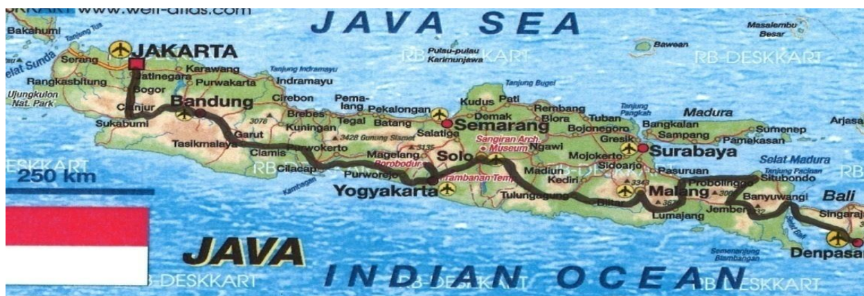
Figure 2. Map of Java Island.

Research design. Due to the fact that challenges of IFRS implementation are not clearly defined, this study will be an exploratory research which aims to seek to understand more about it. Being the prime research in empirical investigation of the phenomenon in interest of Indonesia we have opted for a quantitative approach in analyzing of the research questions. We adopt in this study a survey approach through a series of questionnaires which were designed to obtain opinions about the perception on the impacts and challenges facing Indonesia to adopt IFRS. The aim of this survey was used to gather the opinions of accounting academics (lecturers, PhD and masters students) and practitioners in Indonesian universities regarding the effects of legal, taxation, accounting education, economic and political ties, culture structures on adopting of IFRS in Indonesia.