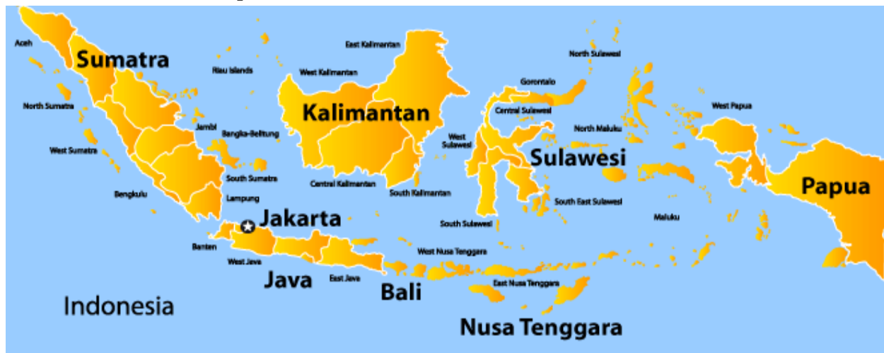
Figure 1. Map of Indonesian.

Astronomically, Indonesia is situated between 6°08' North latitude and 11°15' South latitude, and between 94°45' and 141°05' East longitude and straddles the equator line located at 0° latitude line. Indonesia is the