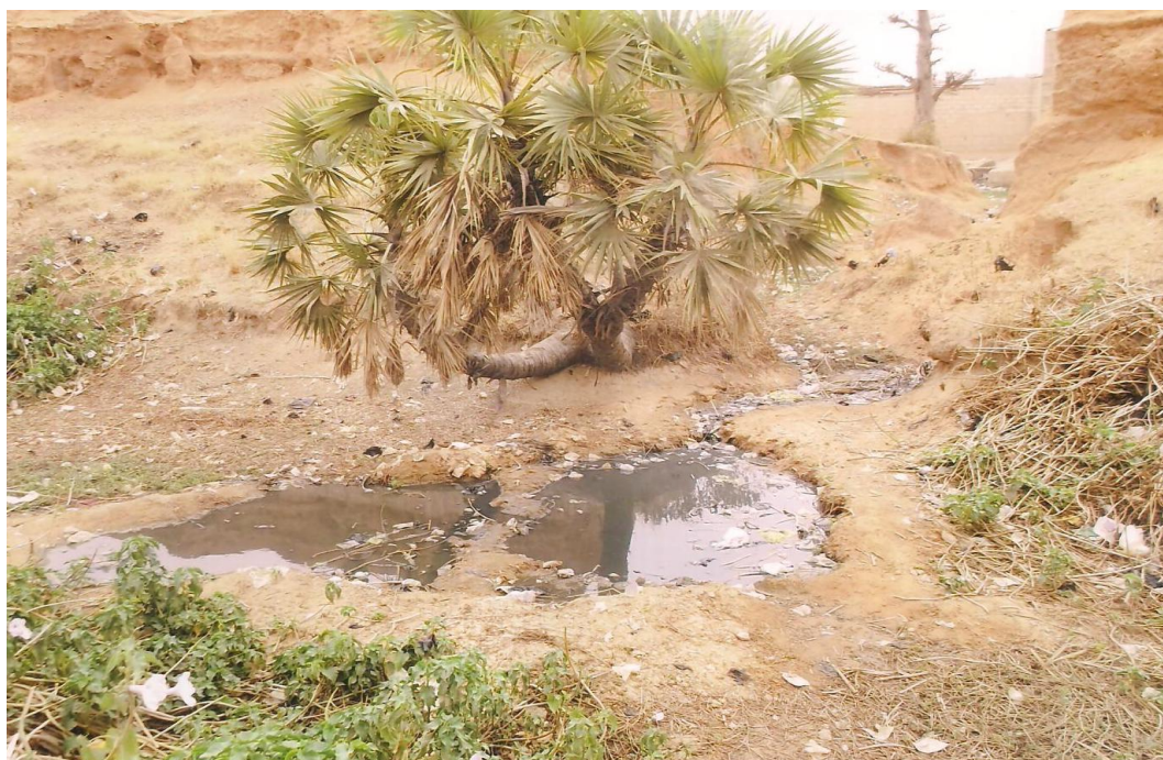
Fig. 2 A puddle behind Katsina City wall at Yammawa Slum area.

poor soil and water management practice. Good soil and water management practice with the provision of adequate surface and sub-surface drainage would help to stop or slow down the process. However, maintenance to repair and reshaped the unlined channels and the drainage system is ongoing in the area. This is essential in improving the water management in the area.